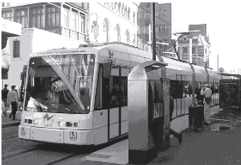
▲ This is the modern variotram currently servicing the inner west. If planning for Anzac Parade light rail started now, residents and students could be travelling on these comfortable modern vehicles within three years!

Write to the Premier and the Minister for Transport, Carl Scully, asking them to ensure that this corridor is preserved, and light rail is put back on the agenda.