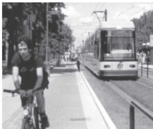
◀ This light rail system is in Freiburg Germany. Line 8 at the stop Studentenwerk , shows low floor vehicles operating on grass easements with easy bicycle and pedestrian access.

By contrast the 22 cities with bus-only systems saw patronage decline on average by 5.6 per cent. The results