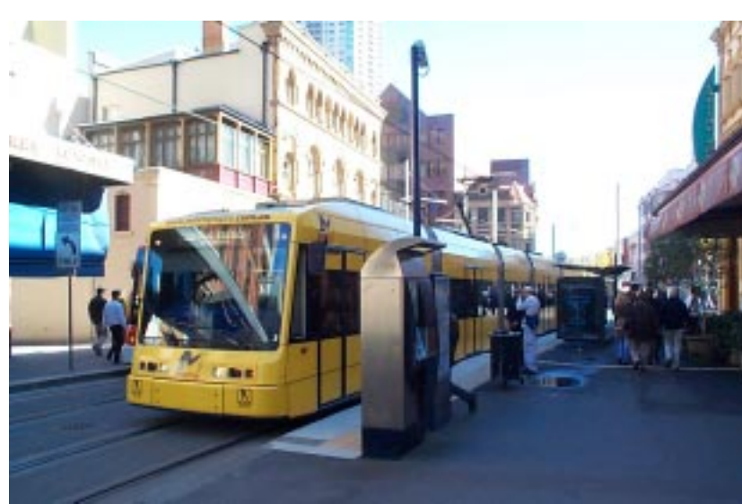
This is the class of vehicle we could see on the Bay Light Express routes: air conditioned, wheelchair and bicycle accessible, these modern Variotrams provide a comfortable and 'iolt-free' ride.

The proposal consists of two links—Bay Light East and Bay Light West. The two would skirt the neighbourhoods of the Botany Bay Region, linking residential districts, universities, retail,